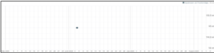
Caddisfly Larva (m 2 )