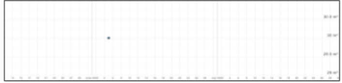
Stonefly Nymph (m 2 )